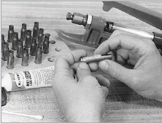
③ PREPARE YOUR CASES Inspect your cases while lubricating them. Discard all cases with split necks, indications of head separation or other defects. Wipe on a thin film of Lee Case Lubricant with your fingers. Fingers are the best way of lubing a case as any grit that could damage the die is wiped away. The case may be immediately sized or you can let the lube dry.