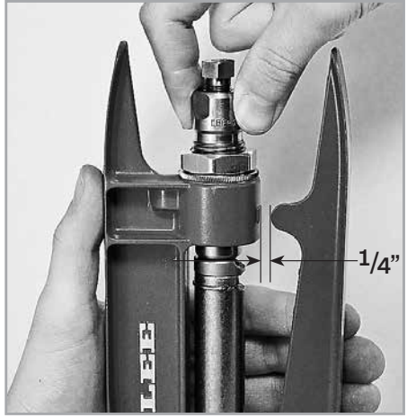
② INSTALL SIZING DIE Insert a Breech Lock bushing and screw the sizing die in until it touches the shell holder and moves the lever off the stop \frac{1}{4} ". When properly positioned, tighten the lock ring. NOTE: DO NOT move the lever off the stop when using carbide dies.