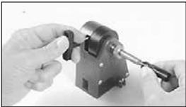
Trim the case using the Lee Case Trimmer