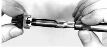
Lee Case Trimmer Simplest and safest way to check the case and trim to the correct length.

After a few loadings, cases tend to get longer. This could be dangerous if the case were so long that it would pinch the bullet in the end of the chamber. Pressure high enough to damage the gun could result. Notice how the case length gauge passes through the case and stops against the lock stud and trims every case to the correct length.