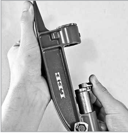
① INSTALL SHELLHOLDER