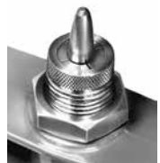
Lee Factory Crimp Die

crimp will crush the case. For proper crimp, all cases must be trimmed to the same length. For best utility and accuracy, consider the Lee Factory Crimp Die. You will never crush a case; no crimp groove is required and trim length is not critical.