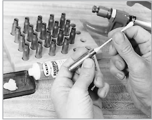
Be sure to lube the inside of the case neck with a cotton swab.