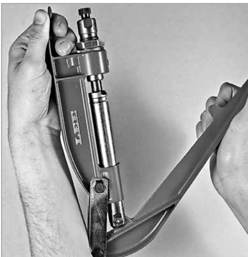
④ PLACE THE LUBRICATED CASE in the shell holder and squeeze the levers together. Open the levers and remove the case. Do this with all of the cases before proceeding to the next step. CAUTION After every box of 20 rounds, remove the shell holder and dump out the spent primers.

If for any reason you do not use Lee Resizing Lubricant, be very careful not to contaminate the powder or primers. All other brands are oil based and have serious, detrimental effects on powder and primers. Because of the stickiness, they also attract grit that can damage the die. Lee Resizing Lubricant costs less and is so superior that it is worth the effort to insist upon it or order direct from the factory.