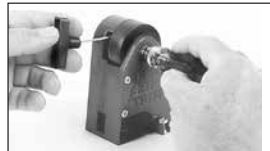
Polish case with steel wool, scouring pad or crocus cloth